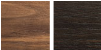
NC walnut canaletto