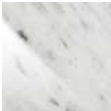
BC polished white Carrara