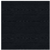
fr73 open pore matt black ashwood