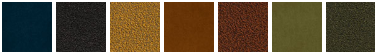
B929 B246 B247 B930 B248 B931 B249