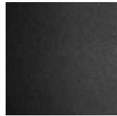
GFM69 graphite embossed