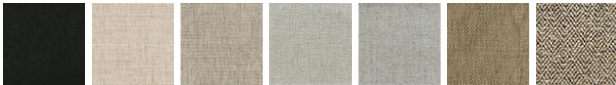
B932 B714 B713 B520 B530 B401 B721