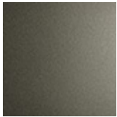
GFM11 titanium embossed