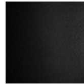
GFM73 black embossed