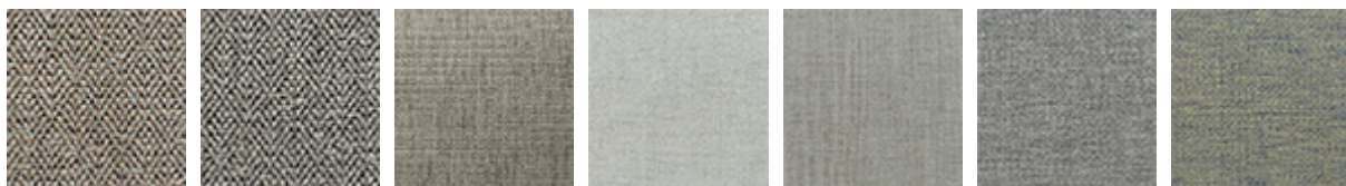
B720 B722 B403 B420 B521 B710 B711