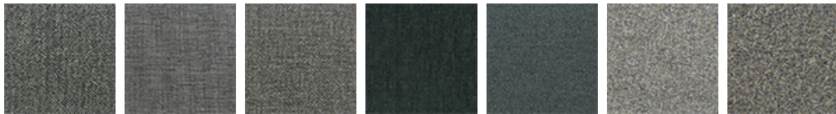
B540 B522 B541 B531 B421 B220 B221