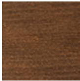
FNC walnut canaletto stained beech