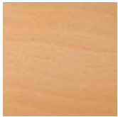
F1 natural stained beech