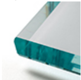
bevelled extra clear