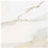
OD05 matt Golden Calacatta