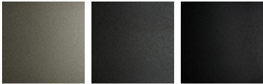
GFM11 titanium embossed