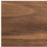
NC walnut canaletto