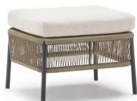
Poggiapiedi / Pouf Footrest / Pouf

Powder coated aluminium frame chairs in hand woven man-made fibre. Cushion with Dryfeel foam padding for outdoor use.