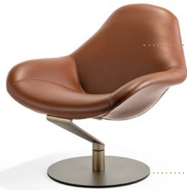
ZENITH POLTRONA LOW