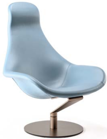
ZENITH POLTRONA HIGH